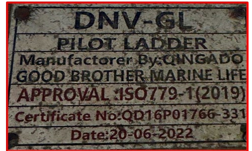
Figure 1: Fraudulent Certification Placard

Marine Inspectors from Sector Maryland-National Capital Region (NCR) discovered counterfeit pilot ladders during a Port State Control Examination at the Port of Baltimore. The identification plate on the ladder (Figure 1) contained several errors, including referencing ISO 779-1 instead of the correct standard, ISO 799-1, and lacking the ISO 799-1 designation type. Additionally, while the serial number on the ladder matched the accompanying certificate, the number of steps and the length of the ladder did not align with the specifications listed on the certificate.