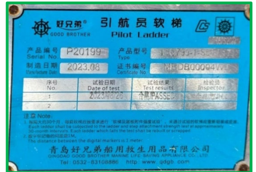
Figure 2: Valid Certification Placard.

The plate and certificate indicated that the ladder was produced by “QINGDAO GOOD BROTHER MARINE LIFE SAVING APPLIANCE Co. LTD.,” a company that manufactures SOLAS-approved pilot ladders. However, in March 2019, the Australian Maritime Safety Authority identified counterfeit pilot ladders falsely bearing this company's name and SOLAS certification. An authentic example of a pilot ladder plate from QINGDAO GOOD BROTHER MARINE LIFE SAVING APPLIANCE Co. LTD is shown in Figures 2 and 3.